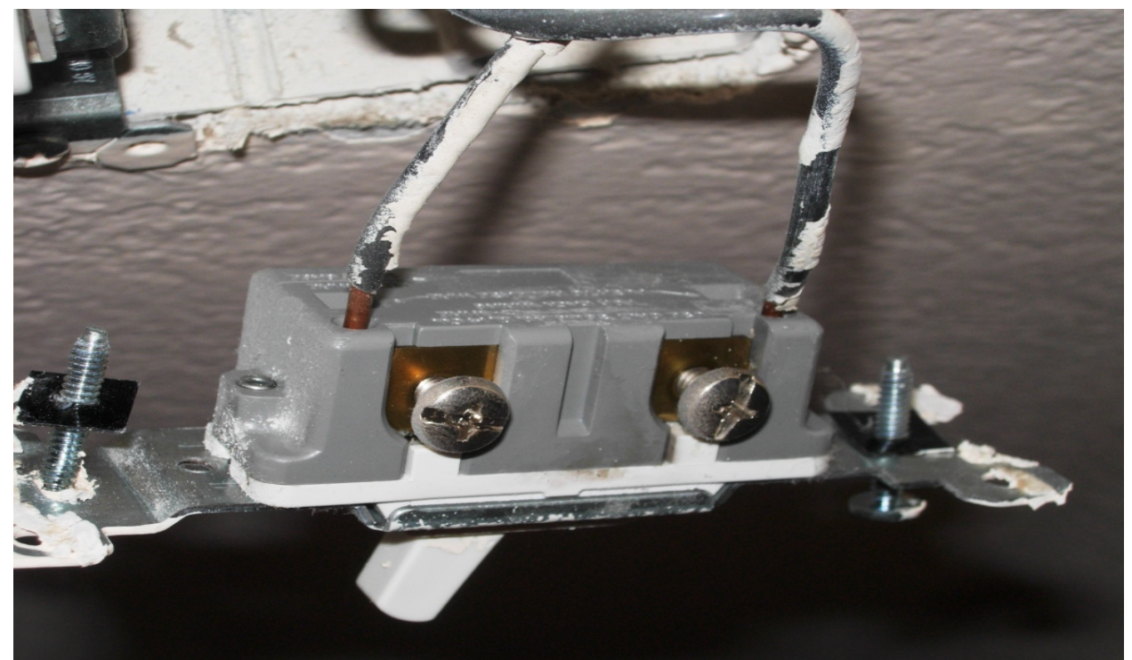
Illustration by Ian Warpole

What it means: On newer switches and receptacles, wires pushed in the back are more likely to come loose than those anchored around screw terminals.