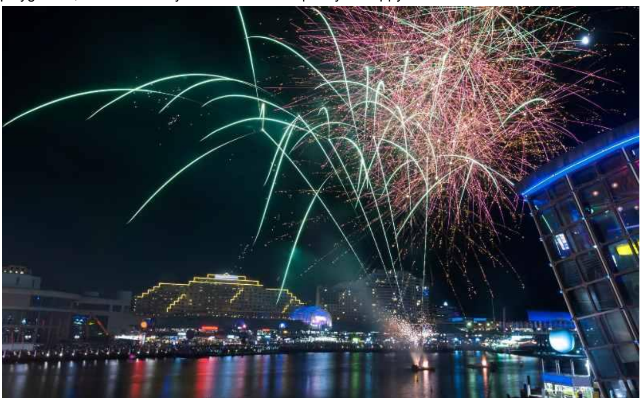
Fireworks in Darling Harbour, Sydney, Australia Even if there are no events on at Darling Harbour, it's a great people-watching spot, and there are plenty of places to sit and relax.

Darling Harbour – There is almost always something happening at Darling Harbour, from buskers and street performers to free fireworks and concerts. There is a fantastic children's playground, and the nearby restaurants have plenty of happy hour deals.