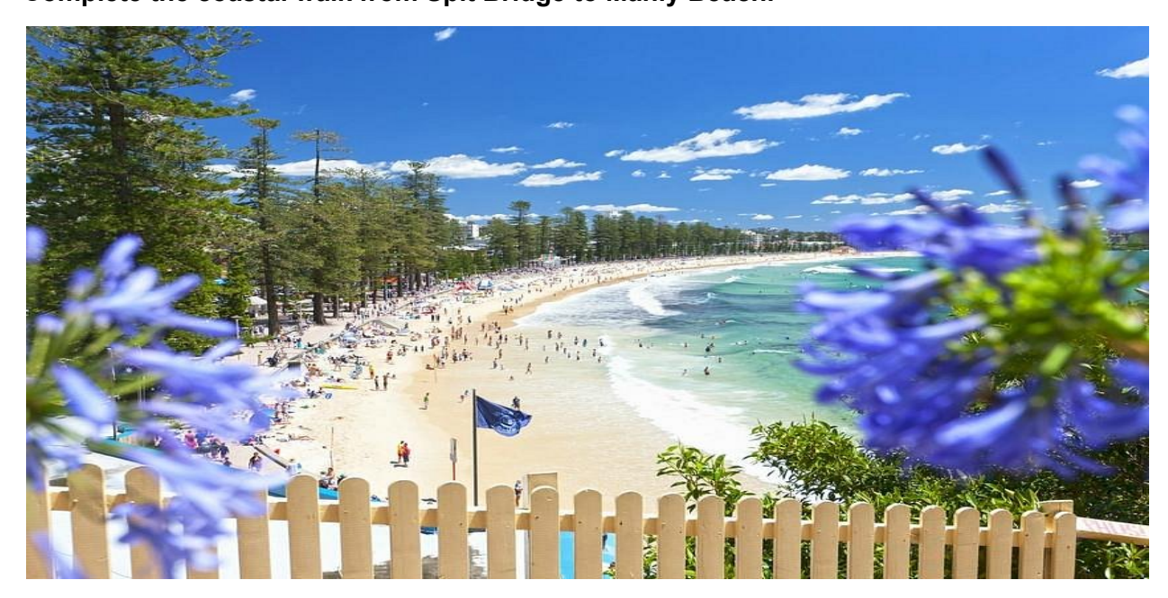
This 11 kilometer walk — that's 6.8 miles for you Americans — takes roughly three hours and winds through native bushland and small beaches. Some highlights include 1,000-year-old Aboriginal rock engravings and, of course, the spectacular ocean views.